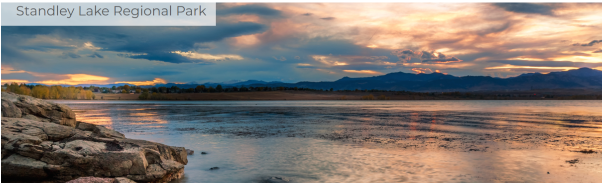
Standley Lake Regional Park